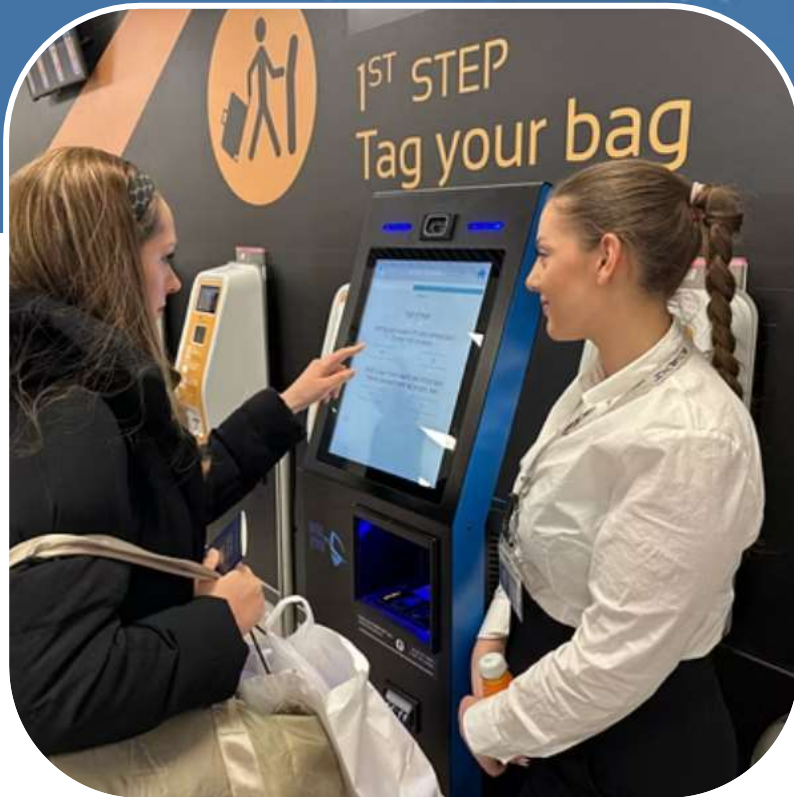
North America JFK, EWR